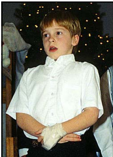
'Miracle In The Manger' Presented by Woodstock SDA school kids December 14-15, 2001